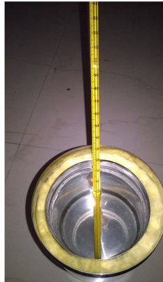
Fig 4. The storage tank

4) The storage tank : The storage tank is made of concentric steel cylinders with glassy wool which acts as insulation to prevent the heat loss. the material of concentration is SS316 which is best suited for water storage. The thermal conductivity of glassy wool is 0.03 W/m.K which is sufficient to maintain the temperature for longer periods of time.