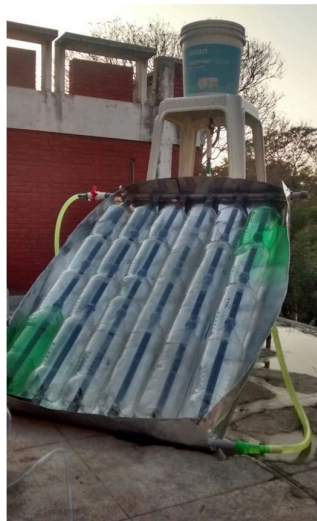
Fig 5. Solar Water Heater – Final Installation

Over time the plastic bottles become opaque which reduces the heat caption. To overcome this, the pipes can be repainted but it is adviced that once the bottles become opaque they should be replaced and the used bottles should be send to recycle dump.