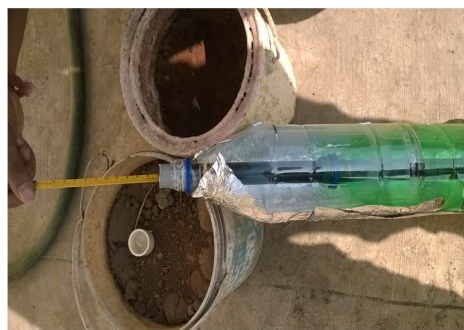
Fig 3. Aluminium Reflector Sheet

Aluminium is a naturally available bright metal but in some cases the reflecting surface has been polished to give increased refelcting power. The reflectivity in such types of aluminium sheet is about 65-75%. [4]