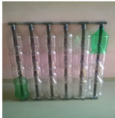
Fig 2. Plastic bottles in each pipe

2) Plastic bottles in each column : Transparent plastic bottles of soft drinks like Pepsi and Miranda are used. Length of bottles is 35 cm and are cut 5 cm from its end allowing 10 cm of the bottle to enter in the next bottle, repeating the operation for as many columns required. Then insert these the bottle columns in the pipe coated with black paint which acts as heat absorber. Seal the top bottle of each column so that the heat is not lost and allow the air to enter from bottom. The air gets heated and trapped in the bottles which in turns heats the pipe.