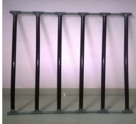
Fig. 1 Column of plastic pipes

2) Plastic bottles in each column : Transparent plastic bottles of soft drinks like Pepsi and Miranda are used. Length of bottles is 35 cm and are cut 5 cm from its end allowing 10 cm of the bottle to enter in the next bottle, repeating the operation for as many columns required. Then insert these the bottle columns in the pipe coated with black paint which acts as heat absorber. Seal the top bottle of each column so that the heat is not lost and allow the air to enter from bottom. The air gets heated and trapped in the bottles which in turns heats the pipe.