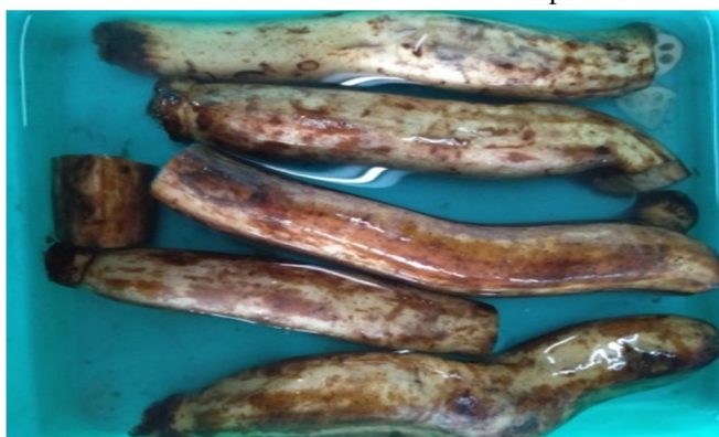
Plate- 4-Rhizome of selected sample

The phytochemical screening of rhizomes with ethanolic and methanolic extract of N. nucifera were analyzed by standard methods and it showed various phytochemical constituents (Harbone, 1984 and Wagner et al., 1984).