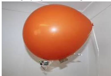
Fig 1 helium balloon

APS is basically a blimp (zeppelin) integrated into a quad copter to spray pesticides in open fields. The main aim of this system is to reduce the ill-effects to humans, lessen the time used for spraying, and use economically the pesticides and to use under any climatic conditions. A Quad copter with a mechanism which can come back to its reference or initial position is used here. This increases the control of the Quad-copter. The blimp gives the lift and the propellers take care of the steering part and the quad copter takes care of the control and also supports the lift and propelling of the Quad-copter. The balloon is connected to the quad copter (mainly) so that the gondola (spray platform) can be lowered, to ease spraying which is explained later.