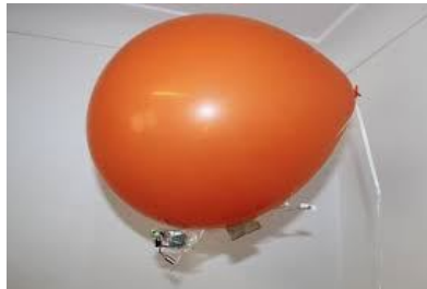
Fig 1 helium balloon

APS is basically a blimp (zeppelin) integrated into a quad copter to spray pesticides in open fields. The main aim of this system is to reduce the ill-effects to humans, lessen the time used for spraying, and use economically the pesticides and to use under any climatic conditions. A Quad copter with a mechanism which can come back to its reference or initial position is used here. This increases the control of the Quad-copter. The blimp gives the lift and the propellers take care of the steering part and the quad copter takes care of the control and also supports the lift and propelling of the Quad-copter. The balloon is connected to the quad copter (mainly) so that the gondola (spray platform) can be lowered, to ease spraying which is explained later.