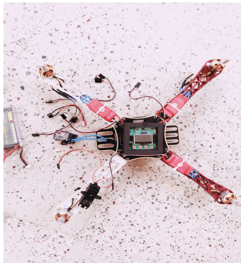
Figure 3 quadcopter

The process begins with providing the power through the battery, at this instance hardware components will initialize and boot. After that the sensors will be calibrated, taking the nominal value that they "see" and consider it as the reference. The receiver would then start testing the frequency and channels in order to make sure that it is correctly connected with the transmitter. The phase called arming can now take place, setting different modes and configuration such as; turning the whole system off (disarm). The next two steps are mainly getting the values that the sensors read and then sending those values to the proportional-Integral (PD) which will get the error and output the final values with the help of the desired values from the transmitter and receiver. To conclude, mixing is the process of sending the commands to the motors based on the desired input plus the output value generated from the PD.