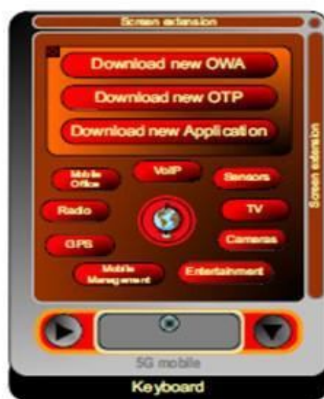
Fig. 3 5G mobile phone design

Fig.3 demonstrates 5G cell phone outline. [12] 5G is being produced to oblige the QoS and rate prerequisites set by approaching applications like remote broadband get to, Multimedia Messaging Service (MMS), video talk, versatile TV, HDTV content, Digital Video Broadcasting (DVB),[18] negligible administrations like voice and information, and different administrations that use transmission capacity. The meaning of 5G is to give sufficient RF scope, more bits/Hz and to interconnect all remote heterogeneous systems to give consistent, reliable telecom experience to the client. [10,11]