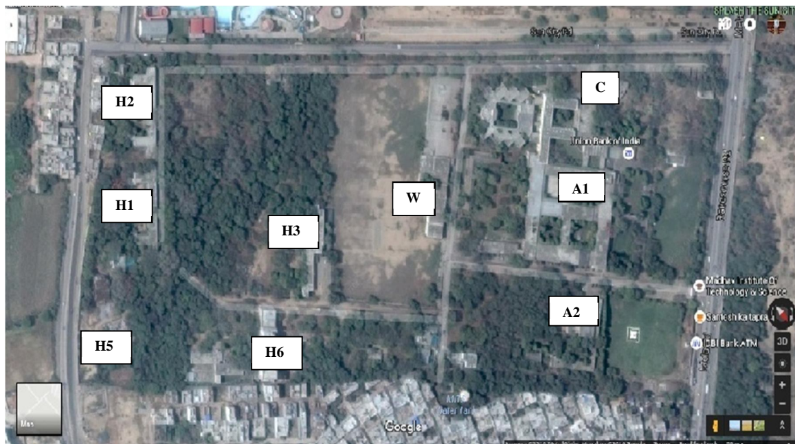
Fig.1 Sampling points in MITS campus.

Waste auditing was conducted to quantify the waste generated. The waste audit constituted of measuring the waste generation rate and finding the composition of the waste. The total quantity of waste generated from the campus is around 150 kg/day or 1.5 quintal/day.