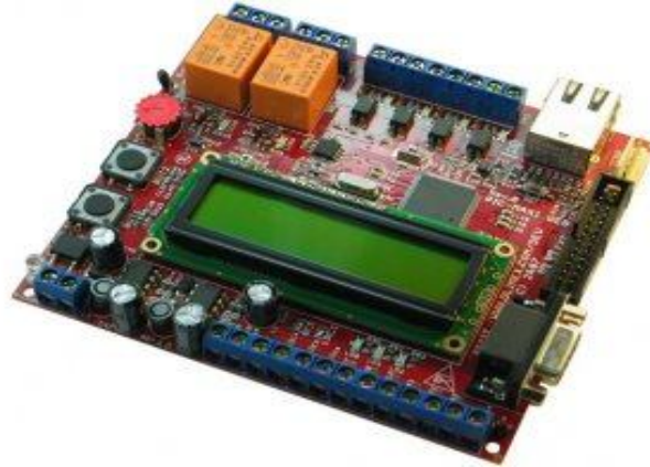
Figure 1: Image of development board

enables the user to control the operations of the machine. Just by pressing keypad and the user can perform ON/OFF operations on the system. In this machine, we have included Gsm sim900, Microcontroller, Keypad, LCD