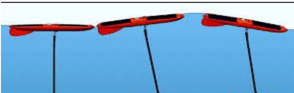
Fig2.3 the Design of the Glider

The Wave Glider vehicle has been intended to withstand extensive vast sea waves and solid winds with its position of safety surface buoy, high-quality tie and strong submerged lightweight flyer. While studying along the Alaska drift, the Wave Glider effectively worked in waves more than 6 m high and winds more noteworthy than 26 m/s (50 ties). The Wave Glider was furnished with a custom umbilical link and payload box to give power and correspondences capacities to the tow body. The operations endured two evenings to test and approve the framework's capacity to gather steady, superb acoustic information. The information can be recovered by means of satellite association while the vehicle is sent