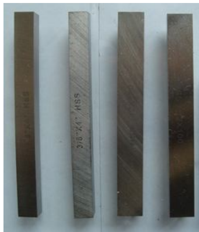
Fig. 2 Geometry of the HSS turning tools

Figure 2 shows the geometry of tool used in the experiment. Rake and clearance angles of the tool are grounded with acceptable surface finish and tolerances according to ISO 3685.