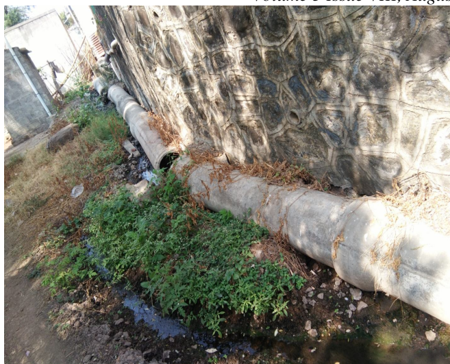
Fig.2 Poor Sewage Disposal System in kondave village