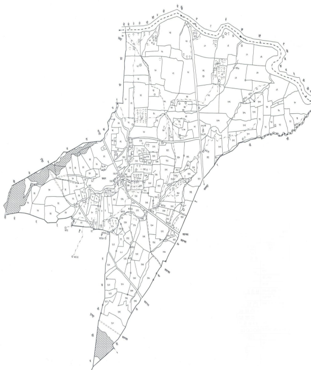
Fig.1 Cadastral map of kondave village

The study area of this project is kondave village situated in the Satara district of Maharashtra state, India [Fig.1]. Kondave village is in satara tahasil of satara district. It is at a distance of 4.6 km from satara stand. S.T. bus service is available in all seasons. The village is situated nearby satara-mahabaleshwar state highway 58. This village has gram panchayat established in year 1941. Agriculture is a main occupation of many people and main crop being sugarcane .Village is having Primary School, Secondary School, Post Office, and Bank etc. Electricity is available in the village. Kondave is very famous agricultural market namely for sugarcane on national level. The latitude 17^{\circ}43'35'' N and longitude 73^{\circ}56'35'' E are the geo-coordinate of the Kondave. Mumbai is the state capital for Kondave village. It is located around 184.5 kilometer away from Kondave. Almost 90% of the village area is occupied by agricultural plantation, fallow land and only 10% of land occupied by Gavthan area and forest area. Kondave village has population about 4,777 and number of houses about 1260 as per census data 2011. The local language of kondave village is Marathi The cadastral map of the kondave village is shown as shown in below [Fig.1].