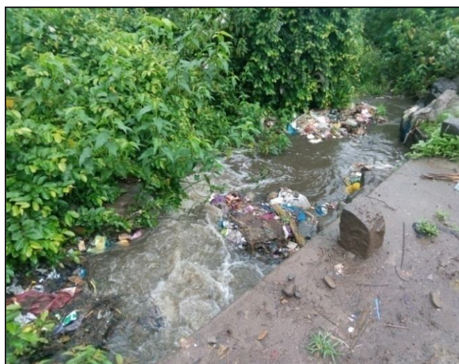
Fig.3 Photograph showing sewage flow towards the venna river