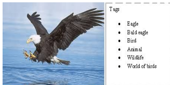
Fig. 1 Example of a social image with its associated tags

The ranking issues in tag based image retrieval have gained wide alertness among researchers in recent years. However, the ranking innovations face following difficulties in its development. First issue is tag mismatch. In social tagging all users have to label their uploaded images with their own tag in social network and share with others. Every user has their own habit to tag photos. Therefore, even for same image there will be several different tags. Thus many irrelevant tags are introduced with uploaded image. Second one is query ambiguity. Users cannot describe perfectly with their single keywords, so add little information to a user's contribution. In addition, equivalent words and polysemy are alternate reasons for the query uncertainty. Images taken at the same interval and fixed spot are fairly similar. How to tackle these issues in re-ranking is the fundamental problem. It is better to re-rank the result by removing the duplicate images from the same user for diversify the top ranked search result. The system proposes a tag based approach with social re-ranking and it systematically fuse the social user's semantic information, visual data and image view times. Also introduce inter-user re-ranking and intra-user re-ranking methods to gain good trade-off between diversity and relevance performance. These methods reserve the relevant image and effectively remove the similar image from same user in ranked result.