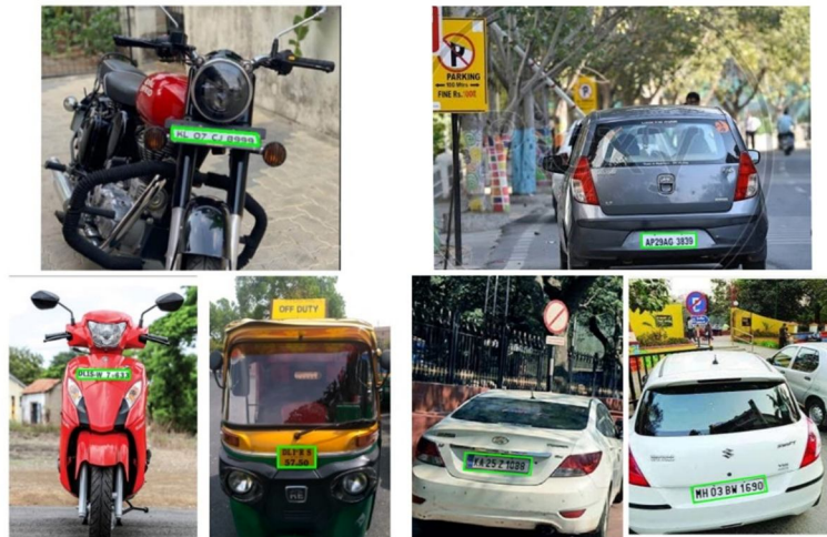
Fig 3: Detecting the number plate using developed System