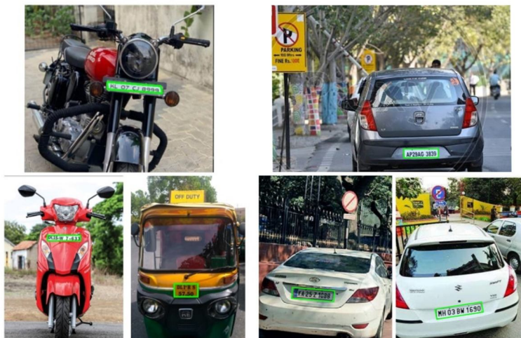
Fig 3: Detecting the number plate using developed System