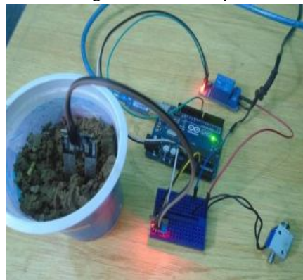
Fig 6. Experimental setup

The results analysis shows how well IoT-based watering systems work to maintain the ideal soil moisture levels for plant growth. These systems offer better irrigation, conserve water, and flexibility, data-driven insights, plant health and growth, remote monitoring and control, and resource efficiency. Plant owners, farmers, and gardeners can use IoT technology to implement accurate and efficient watering practices, which will produce stronger and healthier plants.