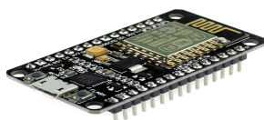
Fig 2, Node MCU10

NodeMCU10 NodeMCU is an open source IoT platform. It includes rmware which runs on the ESP8266 Wi-Fi The term "NodeMCU " by default refers to the ESP8266 is Wi-Fi enabled system on chip (SoC) module developed by Espressif system. It is mostly used for development of IoT (Internet of Things) embedded applications[14-16].