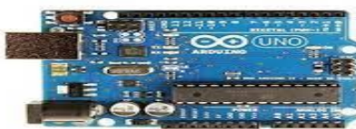
Fig1. Arduino board

Arduino is an open source, computer hardware and software company, project, There are various types of arduinos. all the type of arduinos we are using