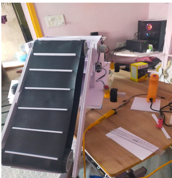
Fig. Hardware prototype

processes by utilizing Internet of Things technology. The Eco Guard project is in line with the overarching objectives of smart city efforts, which are to use technology to enhance urban services and infrastructure. Planning for smart cities must include trash management, and a number of initiatives have looked into integrating automation, data analytics, and IoT devices to improve waste collection