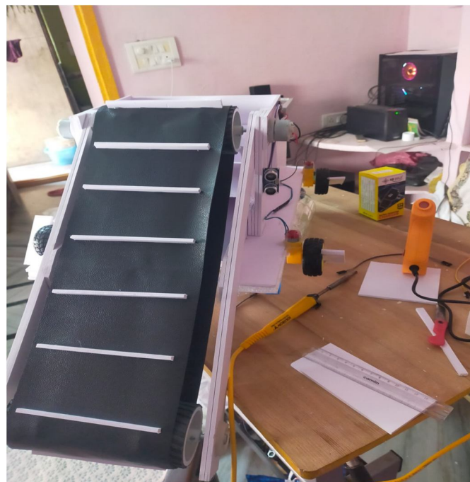
Fig. Hardware prototype

processes by utilizing Internet of Things technology. The Eco Guard project is in line with the overarching objectives of smart city efforts, which are to use technology to enhance urban services and infrastructure. Planning for smart cities must include trash management, and a number of initiatives have looked into integrating automation, data analytics, and IoT devices to improve waste collection