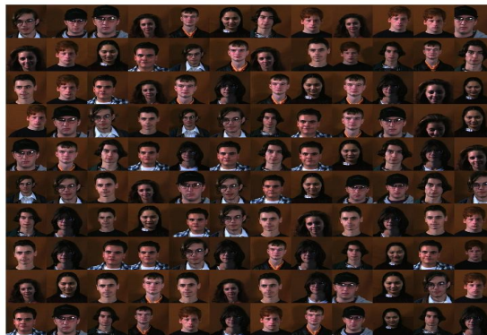
Figure 2: face image samples

I conducted my research on facial recognition using facial images obtained from faces 95 database. I used 100 images of 10 people; it means each person has 10 pictures taken from different angles, and having different zoom levels. A few of the image samples, which I have used in my project, are as-