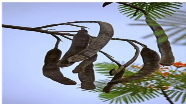
Fig. 3.5 Gulmohar Pods [2]