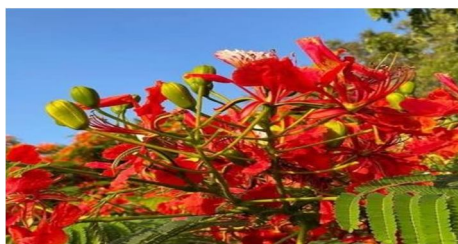
Fig 3.5 .Gulmohar ( Delonix regia ) Tree [1]