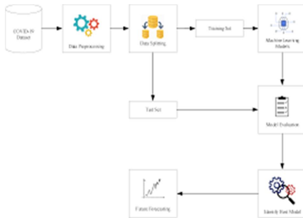
Figure 1: based on machine learning Model for COVID-19 prediction

Figure 1 shows a diagram of the machine learning- based COVID-19 prediction model used in the study by researchers at the University of Toronto. The model used data on demographics, disease transmission, and healthcare capacity to forecast the COVID-19 outbreak in nursing homes.