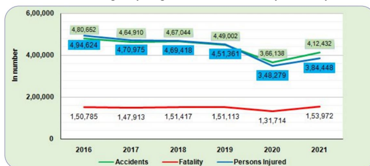
Fig 1 Number of Accidents 2016-2021

In addition to this, drivers often work long hours without adequate breaks, leading to fatigue and reduced concentration levels. Poor road infrastructure and inadequate safety measures such as speed limits, road signs, and lighting also contribute to accidents involving heavy vehicles in India, there is still a long way to go to ensure the safety of heavy vehicles on Indian roads.