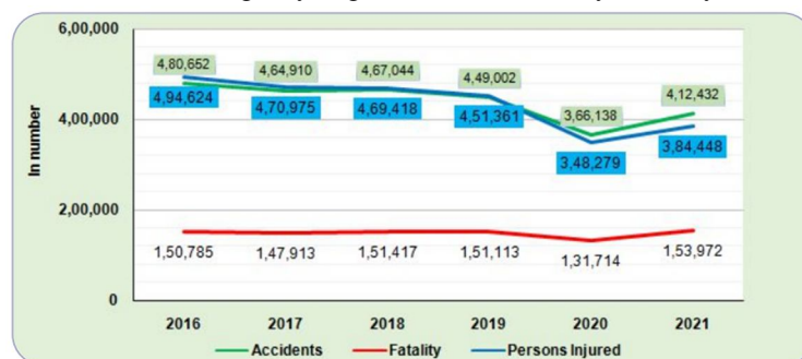
Fig 1 Number of Accidents 2016-2021

In addition to this, drivers often work long hours without adequate breaks, leading to fatigue and reduced concentration levels. Poor road infrastructure and inadequate safety measures such as speed limits, road signs, and lighting also contribute to accidents involving heavy vehicles in India, there is still a long way to go to ensure the safety of heavy vehicles on Indian roads.