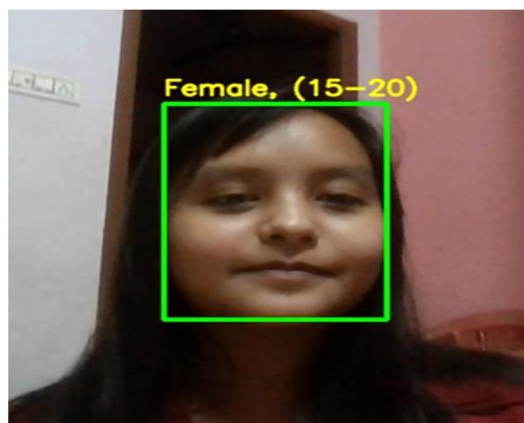
Fig 5.2: Determining the gender and age group of an individual appearing in a webcam or live video stream.