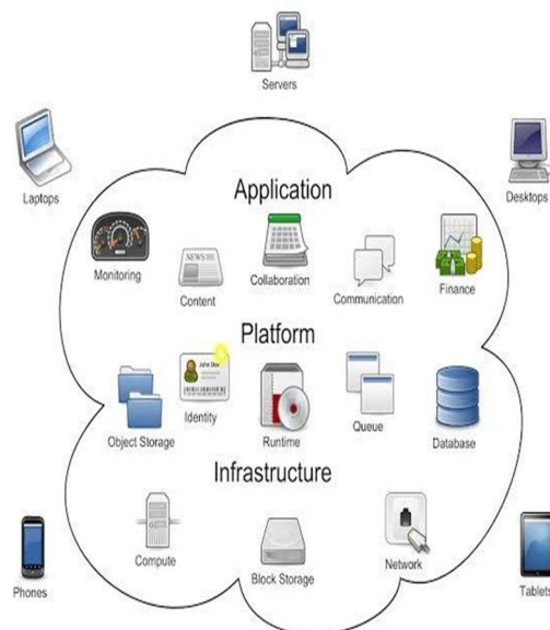
Fig.1: Cloud Computing

With its ability to provide scalable, on-demand access to a wide range of computer resources via the internet, cloud technology has completely changed the face of modern computing [1]. Organizations may now manage their IT infrastructure more flexibly, cut expenses, and streamline operations thanks to this paradigm change. Cloud computing does, however, provide special security challenges in addition to its advantages [2]. To protect sensitive data and guarantee the integrity and availability of services, cloud systems' distributed nature, dependence on outside service providers, and shared responsibility model for security call for extensive security measures [3].