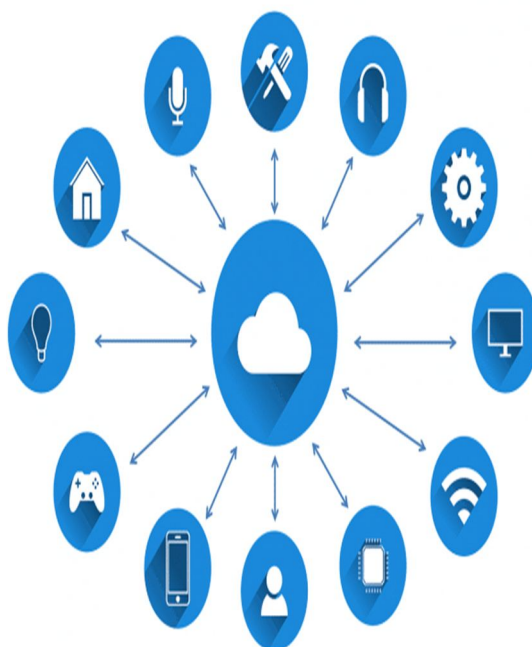
Fig 2: Different technologies cloud cover

2. Security is still a top worry for businesses implementing cloud technologies, despite the many advantages that cloud computing offers [6]. Numerous issues, such as insider threats, data breaches, regulatory requirements, and the com-plexity of shared responsibility models, contribute to security challenges in cloud systems [7]. Strong security protocols and thorough risk assessment frameworks designed specific-ally for cloud settings are needed to meet these difficulties.