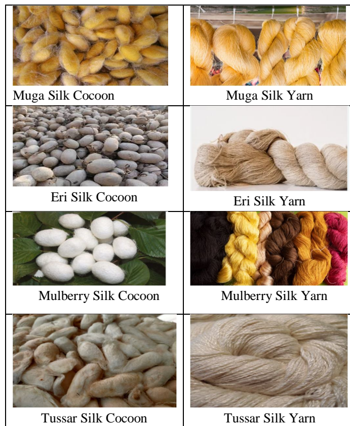
Fig. 1 Types of Silks