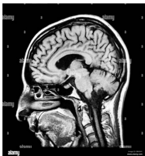
Fig.2 MRI scanning of Brain

To get a difference between the white matter and gray matter, MRI is used for tumors and aneurysms diagnosis purpose. M.R.I does not depend on the x-rays. MRI is more cost effective for x-ray imaging and C.T scanning.