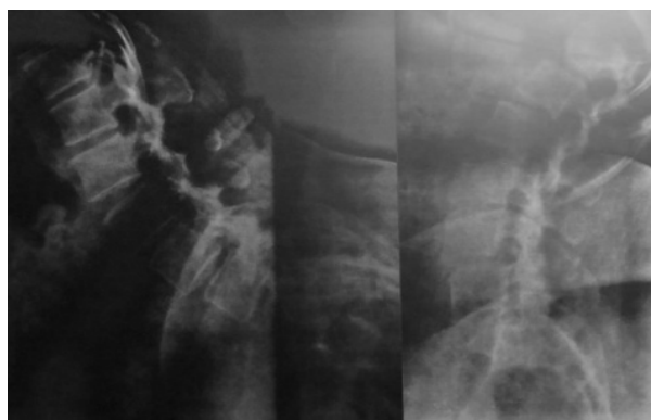
Fig.1 Image of X-ray in L.S Spine LAT view