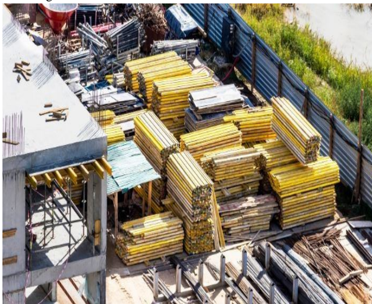
Fig 3. Storage of Construction Materials

Another important consideration is how materials are handled and stored, as this has an impact on construction time, personnel and equipment requirements, and cost in Fig 3.