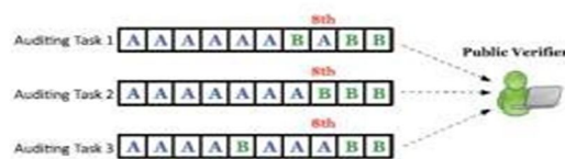
Figure 1 Alice and Bob share a data file in the cloud, and a public verifier audits shared data integrity with existing mechanisms.

We believe that sharing data among multiple users is perhaps one of the most engaging features that motivate cloud storage. Therefore, it is also necessary to ensure the integrity of shared data in the cloud is correct. Existing public auditing mechanisms can actually be extended to verify shared data integrity. However, a new significant privacy issue introduced in the case of shared data with the use of existing mechanisms is the leakage of identity privacy to public verifiers.