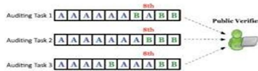
Figure 1 Alice and Bob share a data file in the cloud, and a public verifier audits shared data integrity with existing mechanisms.

We believe that sharing data among multiple users is perhaps one of the most engaging features that motivate cloud storage. Therefore, it is also necessary to ensure the integrity of shared data in the cloud is correct. Existing public auditing mechanisms can actually be extended to verify shared data integrity. However, a new significant privacy issue introduced in the case of shared data with the use of existing mechanisms is the leakage of identity privacy to public verifiers.