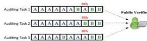
Figure 1 Alice and Bob share a data file in the cloud, and a public verifier audits shared data integrity with existing mechanisms.

We believe that sharing data among multiple users is perhaps one of the most engaging features that motivate cloud storage. Therefore, it is also necessary to ensure the integrity of shared data in the cloud is correct. Existing public auditing mechanisms can actually be extended to verify shared data integrity. However, a new significant privacy issue introduced in the case of shared data with the use of existing mechanisms is the leakage of identity privacy to public verifiers.