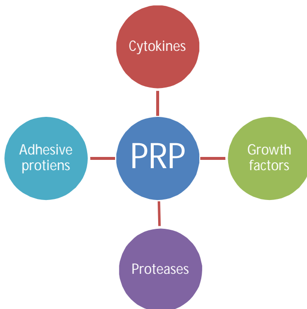
Fig.1 Component of Platelet Rich Plasma

PRP consists of the high concentration of growth factors and cytokines. These growth factors includes platelet derived growth factor, insulin-like growth factor, vascular endothelial growth factor, epidermal GF, hepatocyte GF, platelet-derived angiogenic factor, matrix metalloproteinases 2, 9, and insulin-like GF 1, 2 (IGF-1, IGF-2), interleukin 8, transforming growth factor beta, fibroblast growth factor, epidermal growth factor, connective tissue growth factor, and interleukin-8 [9,10]. Platelet activation triggers the release of these growth factors by a variety of substances or stimuli such as thrombin, calcium chloride, and collagen [11]. PRP as a regenerative medicine contains the biomolecules present in both platelets and plasma which are capable of modulating the altered biological processes. PRP has immunomodulatory, anti-inflammatory, angiogenic, anti-fibrotic and anti-apoptotic properties. It can also stimulate different cells and has no general or adverse effects on other tissues [12].