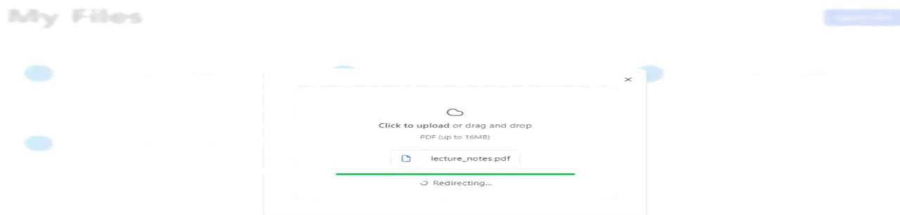
Fig. 2 Example of an Uploading PDF's

The system provides a seamless and user-friendly interface for PDF document uploads, allowing users to easily upload files for processing. Once uploaded, the documents are securely stored in Vercel Blob Storage, ensuring data integrity, fast retrieval, and scalable storage management. To enhance document processing, Langchain is utilized to extract key insights, including text and metadata, enabling efficient information retrieval. Additionally, the system generates vector embeddings of the extracted content, which are stored in Supabase Vector Store, facilitating advanced semantic search and AI-powered interactions, as shown in Fig. 2.