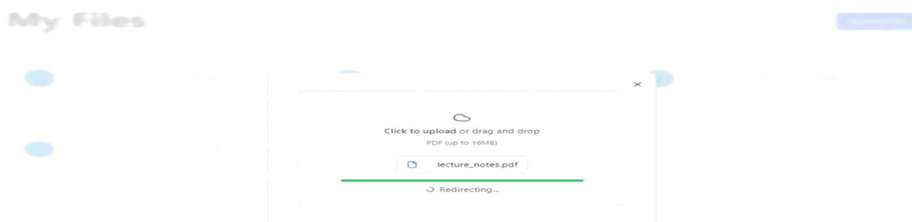
Fig. 2 Example of an Uploading PDF's

The system provides a seamless and user-friendly interface for PDF document uploads, allowing users to easily upload files for processing. Once uploaded, the documents are securely stored in Vercel Blob Storage, ensuring data integrity, fast retrieval, and scalable storage management. To enhance document processing, Langchain is utilized to extract key insights, including text and metadata, enabling efficient information retrieval. Additionally, the system generates vector embeddings of the extracted content, which are stored in Supabase Vector Store, facilitating advanced semantic search and AI-powered interactions, as shown in Fig. 2.