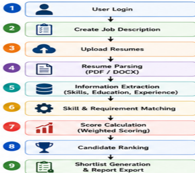
Fig 2: System Workflow Architecture

The recruiter creates a job profile containing required skills, preferred skills, educational requirements, and experience expectations. Candidate resumes are uploaded in PDF or DOCX format and processed through the parsing engine.