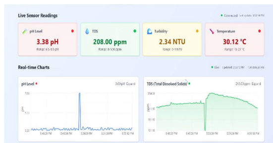
Fig. 6.1 Web UI (Green indicates water condition for that sensor is normal, Yellow indicates needed attention And Red signal indicates critical condition and needs immediate action)