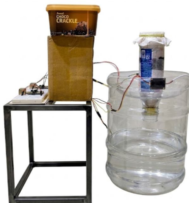
Fig. 5.1 System

The combination of these technologies provides a reliable and cost-effective platform for smart aquaculture monitoring.