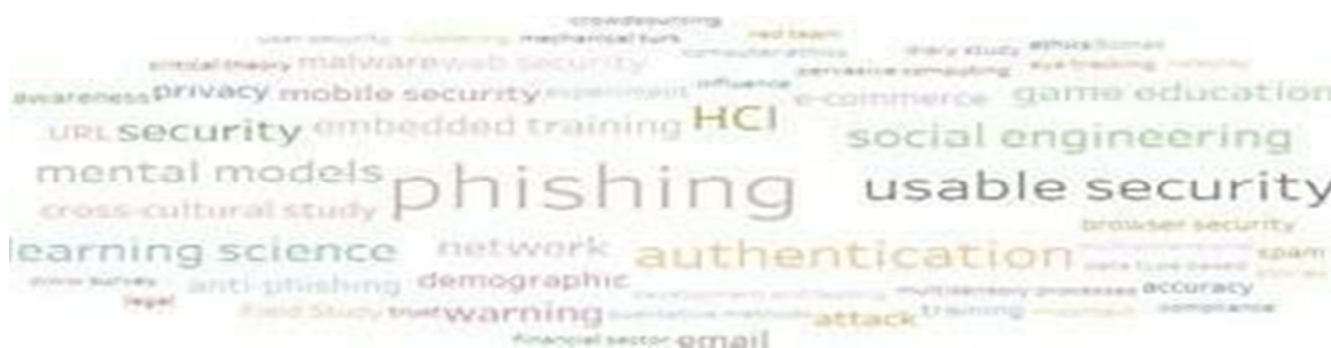
Figure 3 is a word cloud of the authors’ selected keywords from our dataset of 51 user-focused papers.

Throughout the course of our systematic literature review, we found specific trends in phishing research. Although the term “phishing” was coined in 1996 (Kay, 2004), academic researchers did not begin publishing about phishing until 2004 (Dunham, 2004). The first user-centered study we see in our data set was from 2005 (Garfinkel and Miller, 2005). Figure 2 shows the distribution of the ACM Digital Library’s user focused studies in phishing over the past 15 years. Beginning in 2005 with three papers published in this domain, we see a positive trend that ends in 2018, with eight papers published in the area.