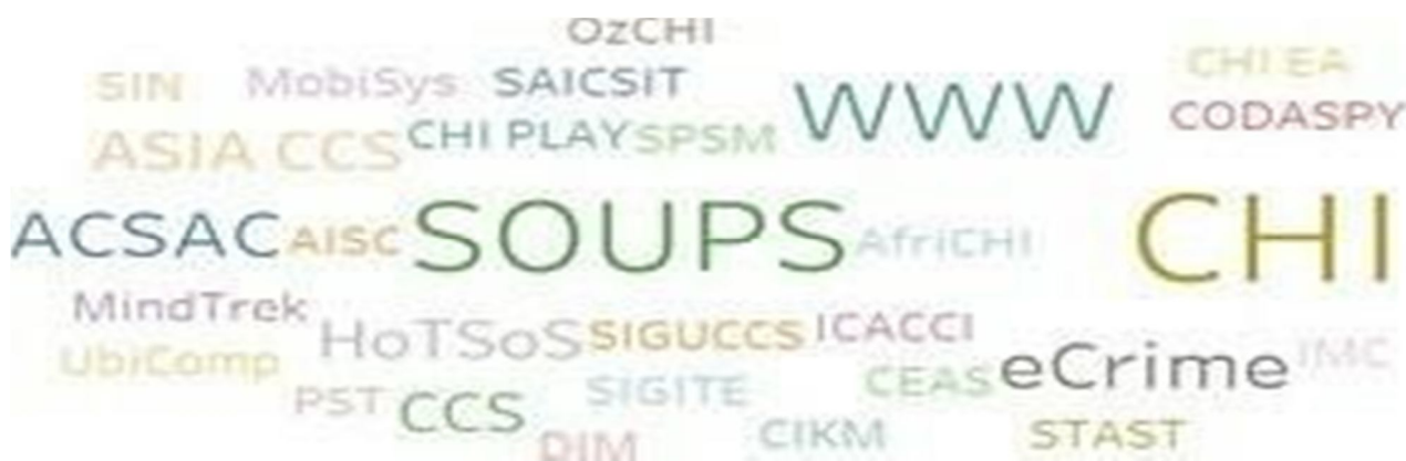
Figure 1: Word cloud depicting relative representation of conference publication venues in our data set of 51 papers.

The central role played by the user in phishing attacks is precisely why we wish to better understand the current state of user-centered phishing research, including a wide range of methodological approaches and potentially significant attack attributes. More traditional research methods include those where users might, for instance, provide interview feedback on a prototype's usability (Reeder et al., 2018). We are also interested, however, in more passive methods that nonetheless tell us much about what users are and are not paying attention to when faced with a phishing attack. For instance, Alsharnouby et al. used eye tracking techniques to obtain their data about user attention to site authenticity (2015). Their results showed that gaze time on the browser elements provided a positive impact on the ability to detect phishing websites, while the participant's technical expertise had no significant influence on the detection procedure they followed. Indeed, Dhamija et al. found that visual deception can fool even sophisticated users; a good phishing website fooled 90% of their participants (2006). Standard security indicators are not effective enough, they argued, given their analysis of participants' strategies for detecting a phishing website. Such studies help establish the effectiveness of human-centered research on phishing, as well as justify our focus on the current state of user studies in the phishing literature.