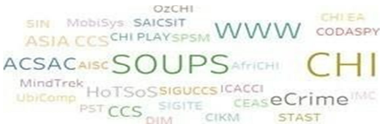
Figure 1: Word cloud depicting relative representation of conference publication venues in our data set of 51 papers.

The central role played by the user in phishing attacks is precisely why we wish to better understand the current state of user-centered phishing research, including a wide range of methodological approaches and potentially significant attack attributes. More traditional research methods include those where users might, for instance, provide interview feedback on a prototype's usability (Reeder et al., 2018). We are also interested, however, in more passive methods that nonetheless tell us much about what users are and are not paying attention to when faced with a phishing attack. For instance, Alsharnouby et al. used eye tracking techniques to obtain their data about user attention to site authenticity (2015). Their results showed that gaze time on the browser elements provided a positive impact on the ability to detect phishing websites, while the participant's technical expertise had no significant influence on the detection procedure they followed. Indeed, Dhamija et al. found that visual deception can fool even sophisticated users; a good phishing website fooled 90% of their participants (2006). Standard security indicators are not effective enough, they argued, given their analysis of participants' strategies for detecting a phishing website. Such studies help establish the effectiveness of human-centered research on phishing, as well as justify our focus on the current state of user studies in the phishing literature.