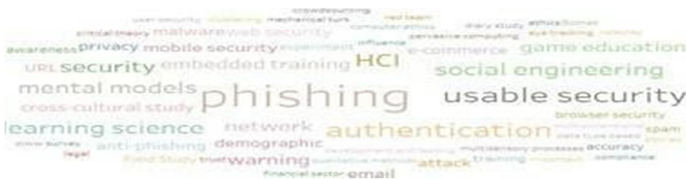
Figure:3 is a word cloud of the authors’ selected keywords from our dataset of 51 user-focused papers.

Throughout the course of our systematic literature review, we found specific trends in phishing research. Although the term “phishing” was coined in 1996 (Kay, 2004), academic researchers did not begin publishing about phishing until 2004 (Dunham, 2004). The first user-centered study we see in our data set was from 2005 (Garfinkel and Miller, 2005). Figure 2 shows the distribution of the ACM Digital Library’s user focused studies in phishing over the past 15 years. Beginning in 2005 with three papers published in this domain, we see a positive trend that ends in 2018, with eight papers published in the area.