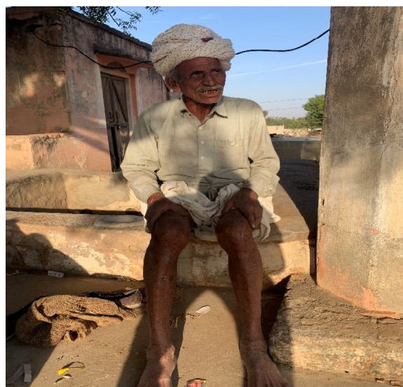
Figure- 4. Skeletal Fluorosis affected person in Makrana block