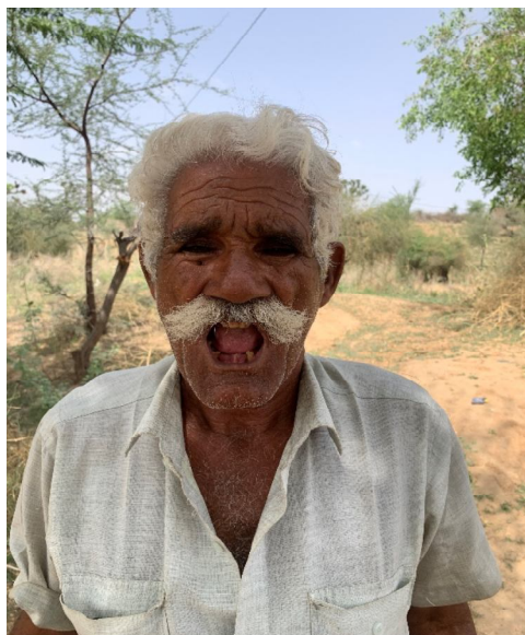
Figure- 3. Dental Fluorosis affected person in Makrana block