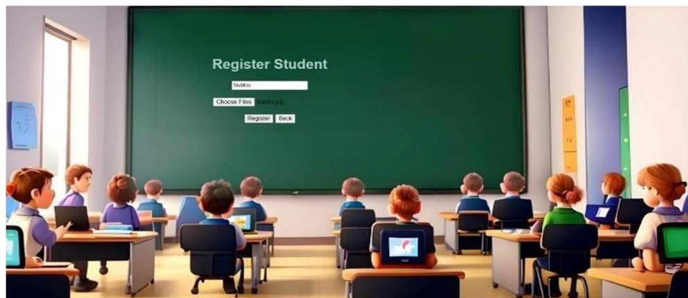
Fig: 4.2 Student registration

The student registration interface allows users to register student biometrics.