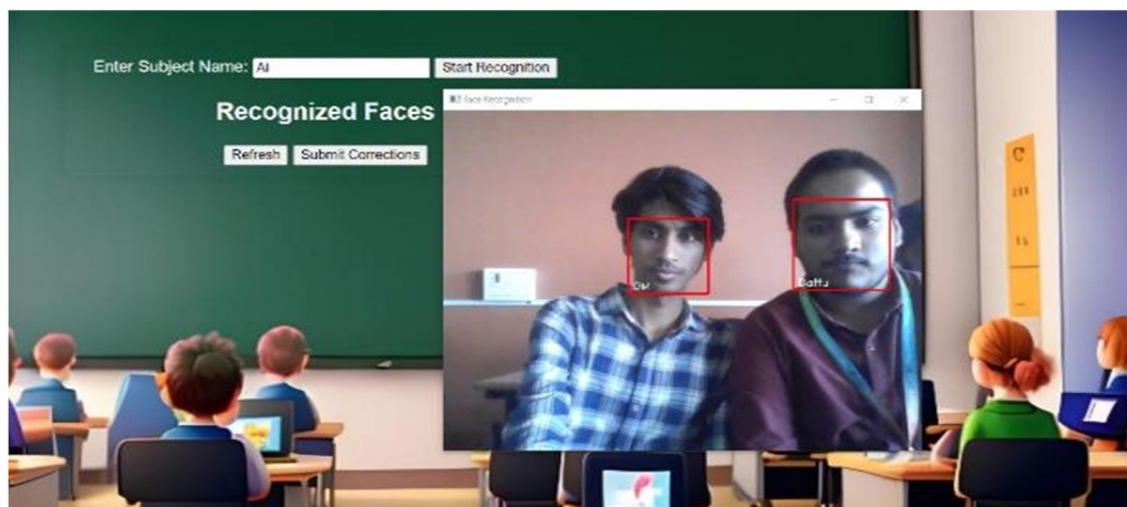
Fig: 4.5 Multiple Face Recognized

Indicates that the system has detected more than one individual in the frame.