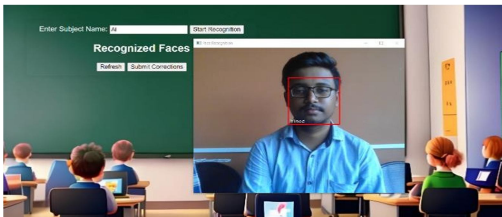
Fig: 4.4 Single Face Recognized

Indicates that the system has successfully identified a single person in the frame.