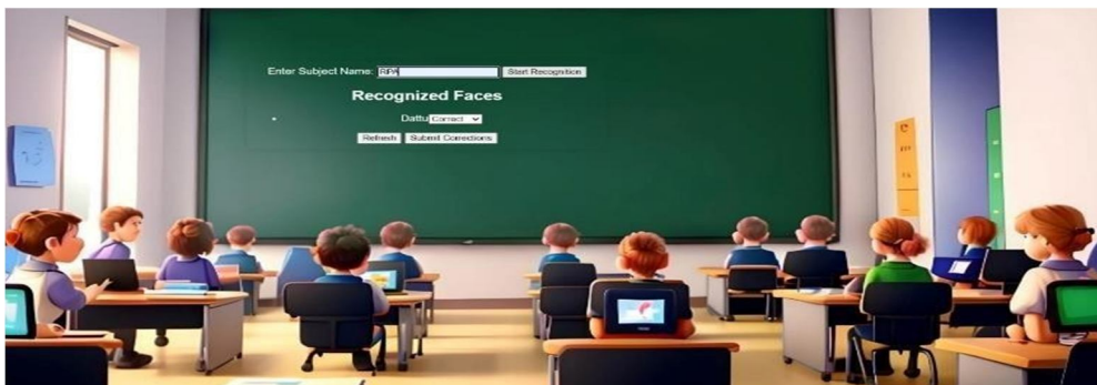
Fig: 4.3 Start Recognition

The attendance marking interface enables users to input the subject name and initiate biometric recognition for attendance tracking.