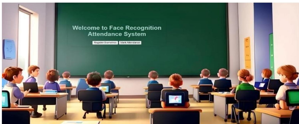
Fig: 4.1 Home page

The homepage serves as a user interface where individuals can register student biometrics and record attendance.