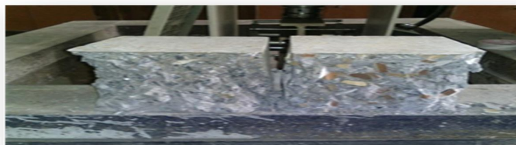
Fig. 2: Testing model of the casted cube the waste ceramic tile casted cube

So that the maximum load can be calculated and according to the optimum weight the construction process can be carried out through this kind of Projects.