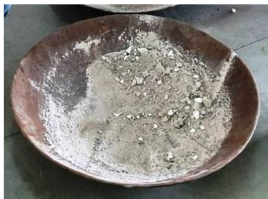
Fig. 1: Ceramic tiled aggregates broken pieces.