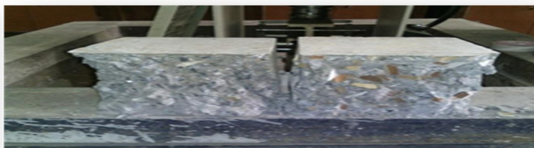
Fig. 2: Testing model of the casted cube the waste ceramic tile casted cube

So that the maximum load can be calculated and according to the optimum weight the construction process can be carried out through this kind of Projects.