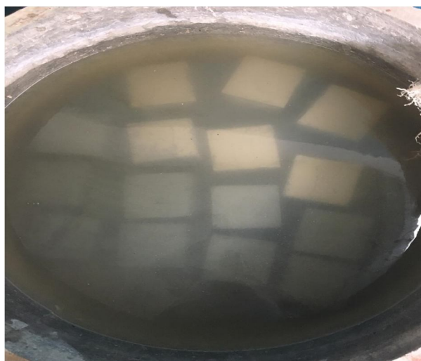
Fig 9 Curing