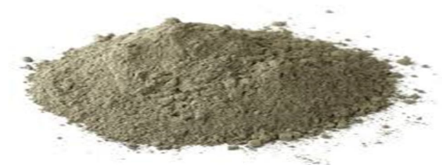
Fig. 1 Cement

The cement used in this project is ordinary Portland cement which is 53 grade & the name of the cement is Coromandel king.