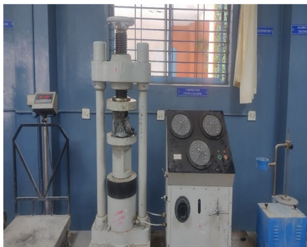
Fig 10 Compression Testing Machine