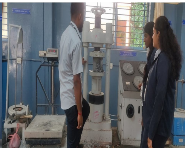
Fig 11 Compression Test