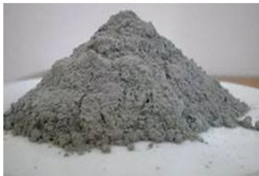
Fig. 2 Sugarcane Bagasse Ash

Sugarcane bagasse ash is a byproduct of sugar factory found after burning sugarcane bagasse which itself is found after the extraction of all economical sugar from sugarcane. In India, approximately about 2.5 Million tons of sugarcane bagasse ash produced every year. The sugarcane bagasse ash is a voluminous material and is an environmental waste sugarcane bagasse ash is non biodegradable waste. The disposal of this material is already causing environmental problems around the sugar factories.