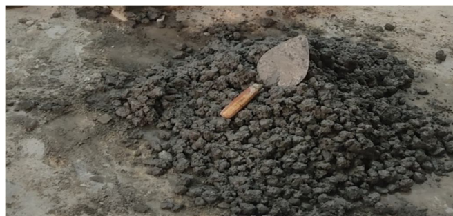
Fig. 5 Wet Mix