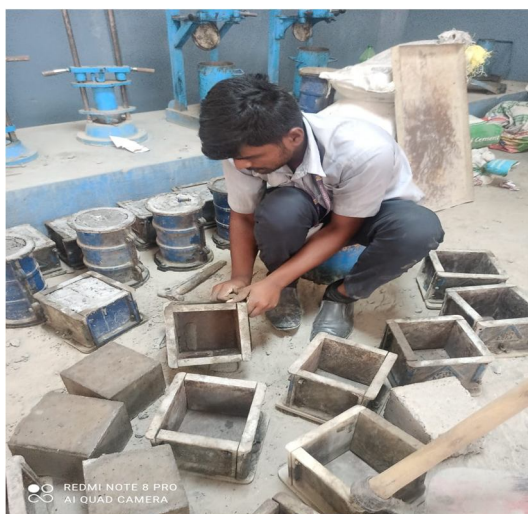
Fig 8 Demoulding