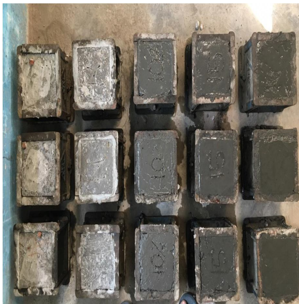
Fig 7 Casting