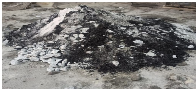
Fig. 4 Dry Mix

By referring to IS 10262-2009 and IS 456-2000, the mix design is carried out for M20 grade of concrete. The required materials are batched based on the values obtained by mix design. The proportion of cement, sand and coarse aggregate is 1:1.7:2.84. At first the mix design values are calculated for 1 m 3 volume and then it computed for standard cube moulds of size 150x150x150 mm & cylindrical moulds of size (150x300) mm. For each fraction of volume of sugarcane bagasse ash and glass powder, two cube moulds are casted and quantities of each materials are calculated for those standard values of the moulds and one cylindrical mould is casted.