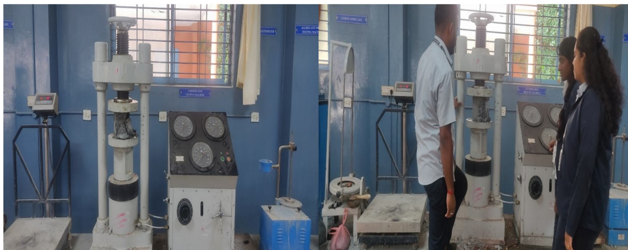
Fig 10 Compression Testing Machine