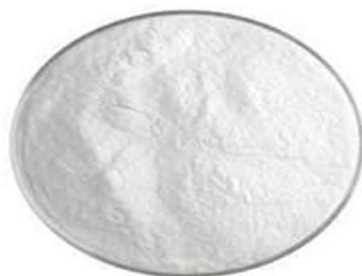
Fig. 3 Glass Powder

In this present study the chemical properties of glass will be evaluated being non-biodegradable in nature, glass disposal has landfill has environmental impacts as the land filling will be expensive. Hence it is better to use glass powder as a partial replacement for a cement.