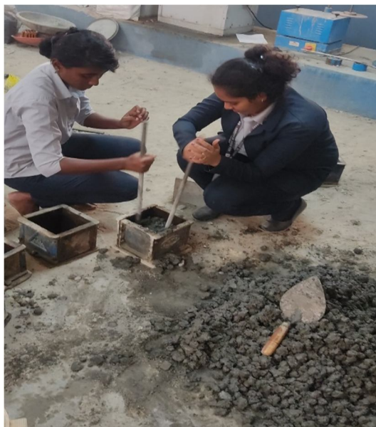
Fig. 6 Compaction