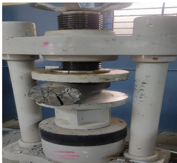
Fig 12 Split Tensile Test

The split tensile strength is the ability of the concrete to resist the direct tension. The tensile strength is one of the basic and important properties of concrete. The split tensile strength is determined by using cylinders. The split tensile strength is approximately about 10% of the compressive strength. Concrete is very weak in tension due to its brittle in nature and is not expected to resist the direct tension. The concrete develops cracks when subjected to tensile forces. Thus, it necessary to determine the tensile strength of the concrete to determine the load at which the concrete cylinders may crack.