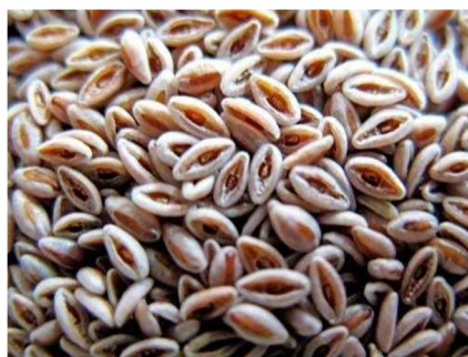
Fig. 2 Ashwagola beeja [7]