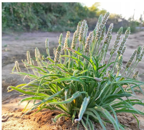
Fig. 1 Morphology of Ashwagola plant [6]