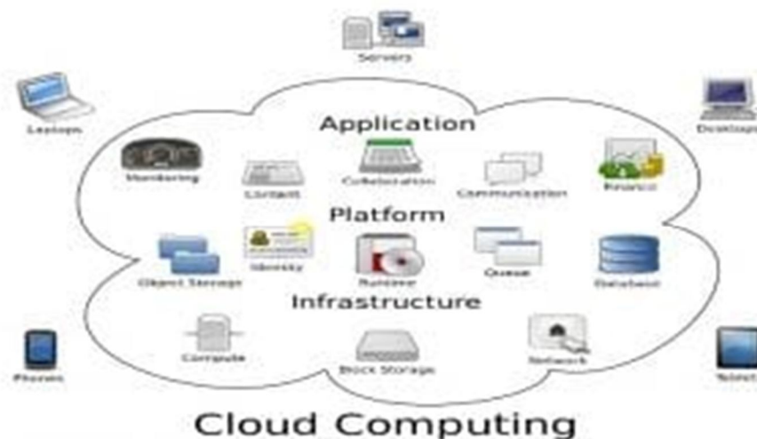
Fig. 2 Image of cloud computing

A variety of services are provided via the internet, or "the cloud," in cloud computing. It involves companies hosting or maintaining large data centers that offer the security, storage space, and processing power needed to operate cloud architecture. Customers pay for the ability to utilize their clouds and an environment that allows devices and applications to speak with one another. Cloud technology works through data centers, where instead of using the storage space on your device, your data is stored remotely on servers.