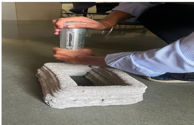
Fig Rebound Hammer test perpendicular to the layers