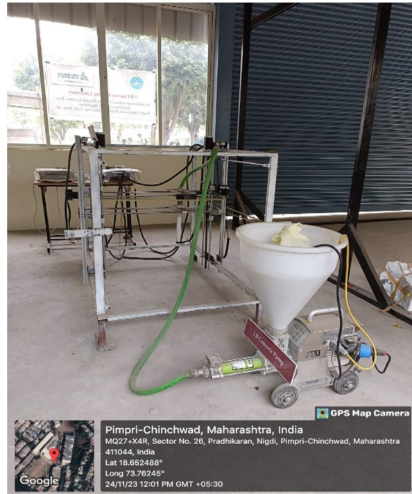
Fig.2 3D Printer