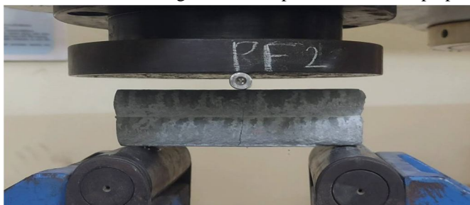
Fig. Flexural test perpendicular to the layers

Flexural testing in 3D printed concrete is crucial as it measures the material's ability to resist bending, which is essential for evaluating structural performance under various loads. This test helps ensure the concrete can withstand tensile stresses, contributing to the overall safety and durability of the structures. It also aids in optimizing material formulations and validating the printing process, ensuring that the final product meets required strength standards and industry regulations. Flexural testing was done on samples with standard size of 160×40×40mm. Testings were done parallel as well as perpendicular to the layers.