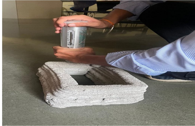
Fig Rebound Hammer test perpendicular to the layers