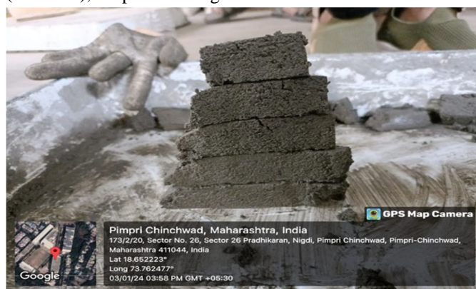
Fig.6 proportional trial sample

Casting of cubes by adding admixture (ACC107), Proportion are given in the table.