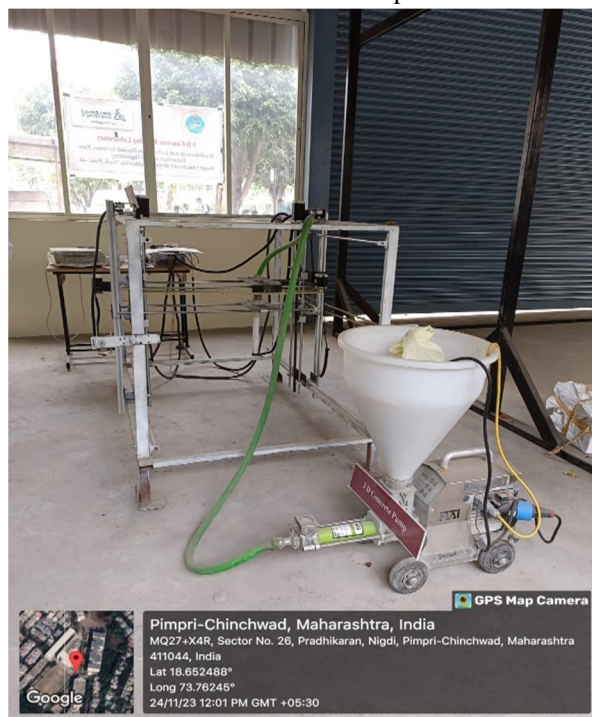
Fig.2 3D Printer