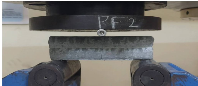
Fig. Flexural test perpendicular to the layers

Flexural testing in 3D printed concrete is crucial as it measures the material's ability to resist bending, which is essential for evaluating structural performance under various loads. This test helps ensure the concrete can withstand tensile stresses, contributing to the overall safety and durability of the structures. It also aids in optimizing material formulations and validating the printing process, ensuring that the final product meets required strength standards and industry regulations. Flexural testing was done on samples with standard size of 160×40×40mm. Testings were done parallel as well as perpendicular to the layers.