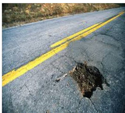
Figure 4. Test Input image

Figure 2 represents the test input image and Figure 3 represents the output for the given input image which was accurately predicted by the model.