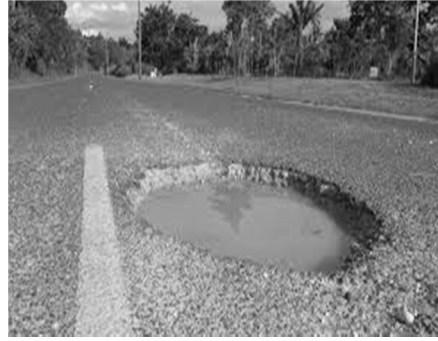
Figure 3. Test Output image

Figure 2 represents the test input image and Figure 3 represents the output for the given input image which was accurately predicted by the model.