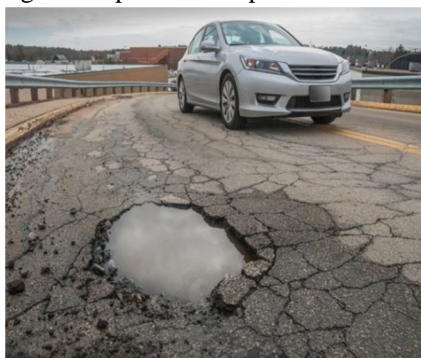
Figure 6. Test Input image

Figure 4 represents the test input image and Figure 5 represents the pothole as an output.