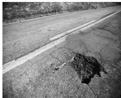
Figure 5. Test Output image

Figure 4 represents the test input image and Figure 5 represents the pothole as an output.