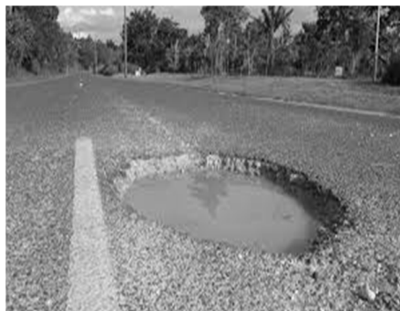
Figure 3. Test Output image

Figure 2 represents the test input image and Figure 3 represents the output for the given input image which was accurately predicted by the model.