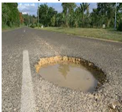
Figure 2. Test Input image

After a successful compilation of the module, it was tested on various images of roads containing potholes. The module was able to detect potholes successfully. A snapshot of the model's output is provided below.