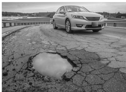
Figure 7. Test Output image

Figure 6 represents the test input image Figure 7 represents the Pothole detected as an output image.