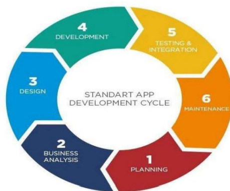
Fig: business analysis on starts up mobile application

As information technology and technical innovation have been incorporated throughout the years, trading apps have radically changed the stock brokerage platform as a whole. Eventually, this led to an increase in the proportion of stock market investors. In order to improve performance and efficiency, this study aims to investigate how people generally perceive the trading apps. In order to increase the number of potential clients from all professions, the trading software should be properly promoted using a variety of digital media, including Facebook ads, blog posts, email marketing, and others. People from all professions should be able to use the app, and it should be created to meet the requirements. The applications should make sure to offer enough features that improve their functionality while guaranteeing user-friendliness. Additionally, it should offer adequate information and real-time customer support, demonstrating the transparency of the app and company. The customer's desire to use the trade will be increased if the app's risk is kept below optimal levels by appropriate monitoring, updating, and maintenance.