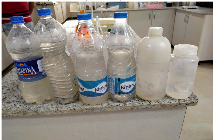
Figure no.- 2 collected sample