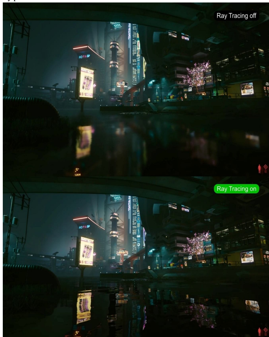
Fig. 1.4 Scattering with and with-out Ray Tracing Implementation.

Scattering is a process when a moving particle are forced to deviate from a straight trajectory by localized non-uniformities in the medium through which they pass.