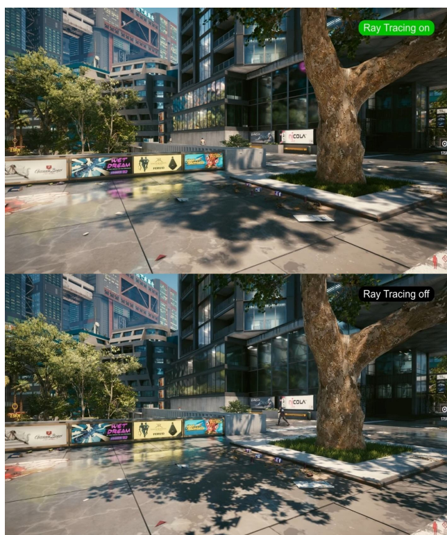
Fig. 1.3 Soft Shadow with and with-out Ray Tracing Implementation.

Soft Shadows are the shadows created by any light source after impinging on an opaque object. It has three distinct parts: umbra, penumbra and antumbra.