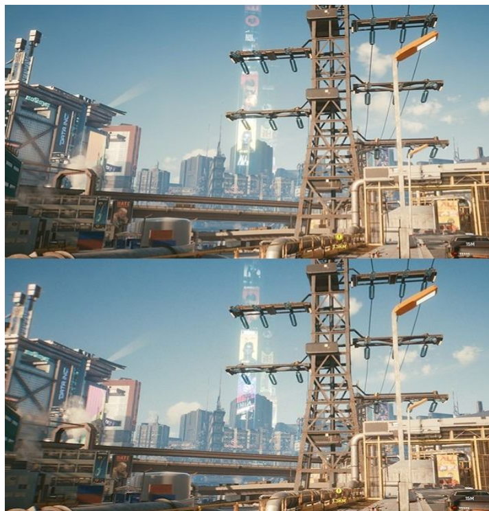
Fig. 1.5 Ambient Occlusion and Dispersion with and without Ray Tracing Implementation