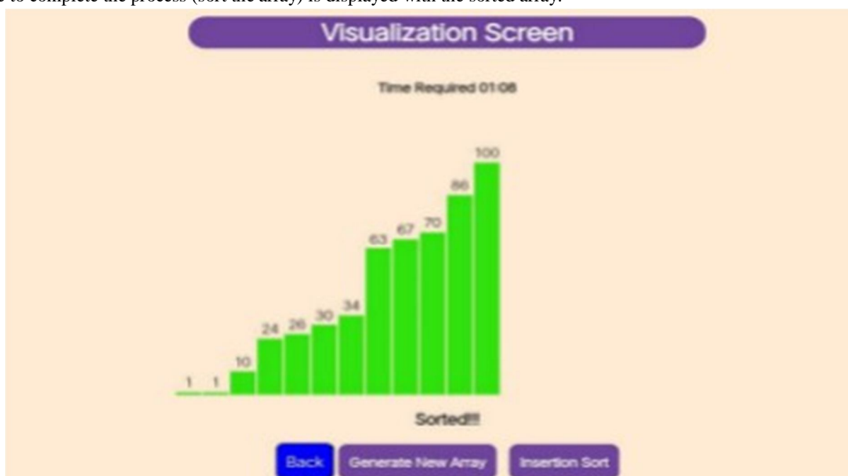
Fig:3 Sorted array with time complexity

Then click on the sort button, the sorting of array get started and the user can see the entire process of the sorting/searching of the particular technique (which the user chooses) in the visual form hence we had given the name to this application as Visualizer. After completion of the process (sorting the unsorted array) the time complexity or the amount of the time required by particular technique to complete the process (sort the array) is displayed with the sorted array.