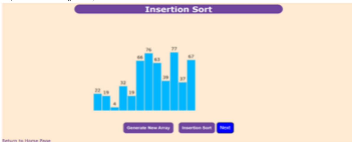
Fig:2 Visualization module

After select particular sorting or searching technique user visit information page of their selected technique (there is the information like definition, algorithm, program or code is available for the user) After visiting information page user need to click go to algorithm and user reach the visualization module, there is the option to generate a new array or to see visualization or sorting on the existing one (as shown in the fig below)