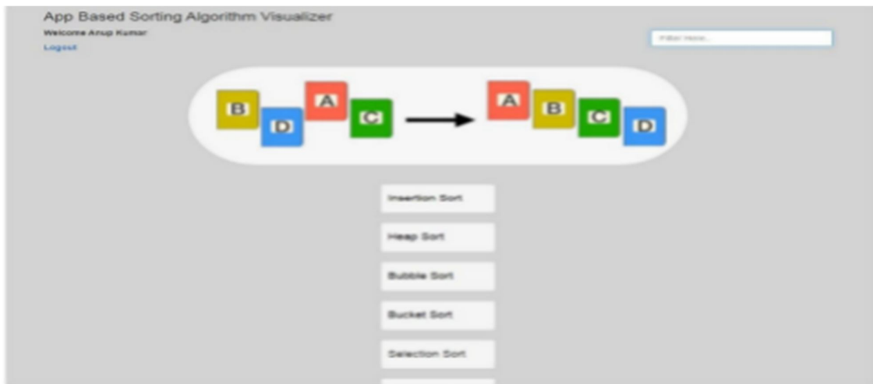
Fig:1 Home page of sorting Algorithm Visualizer

After login successfully home page as shown the fig below