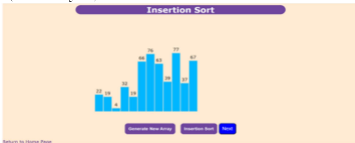
Fig:2 Visualization module

After select particular sorting or searching technique user visit information page of their selected technique (there is the information like definition, algorithm, program or code is available for the user) After visiting information page user need to click go to algorithm and user reach the visualization module, there is the option to generate a new array or to see visualization or sorting on the existing one (as shown in the fig below)