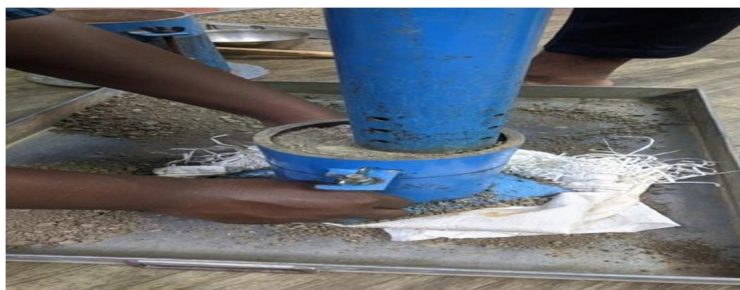
Modified proctor test (Heavy compaction)

IS: 2720 (PART 8): 1983, to determine the water content-dry density relation of soil using heavy compaction.