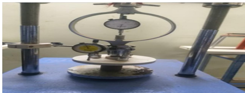
UCS Testing machine set up