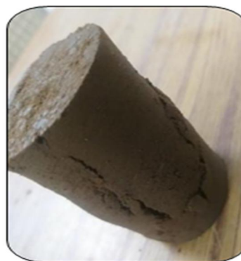
UCS SAMPLE FAILURE PATTERN