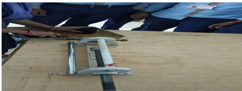
UCS Sample preparation