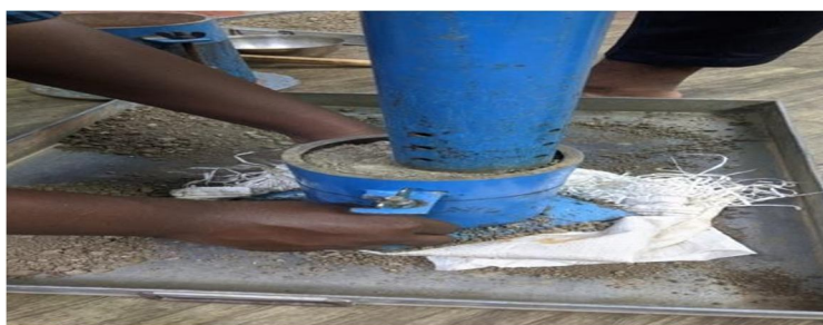
Modified proctor test (Heavy compaction)

IS: 2720 (PART 8): 1983, to determine the water content-dry density relation of soil using heavy compaction.