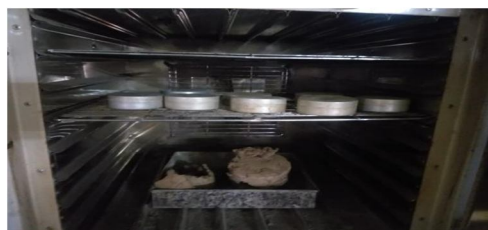
Thermostatically Controlled Ovens