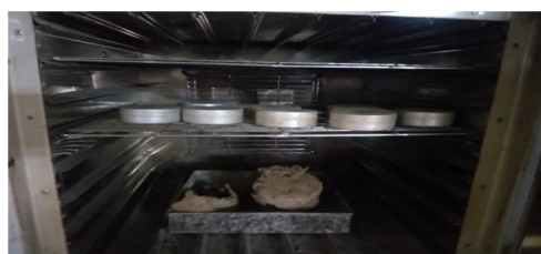
Thermostatically Controlled Ovens