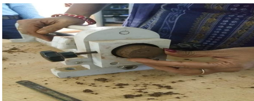
UCS sample extractor