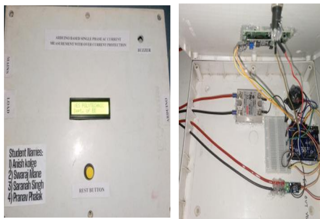
Fig. 2. KIT PHOTO