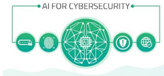
Fig 3.1 Ai for cybersecurity [7]