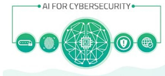
Fig 3.1 Ai for cybersecurity [7]