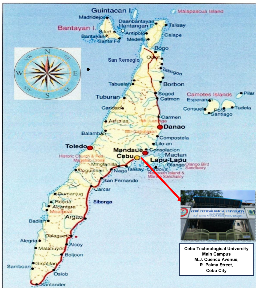
Figure 3. Location Map of the Study

The researchers aim to gather quantitative data from 45 Special Education Teachers using a complete enumeration. On the other hand, the researchers aim to collect qualitative data from these participants until data saturation is reached. The study conducted from April 2022 to May 2022 to Special Education Teachers currently taking their master's degree at Cebu Technological University from Cebu City Division, Cebu Province Division, and from other Divisions for School Year 2021-2022.