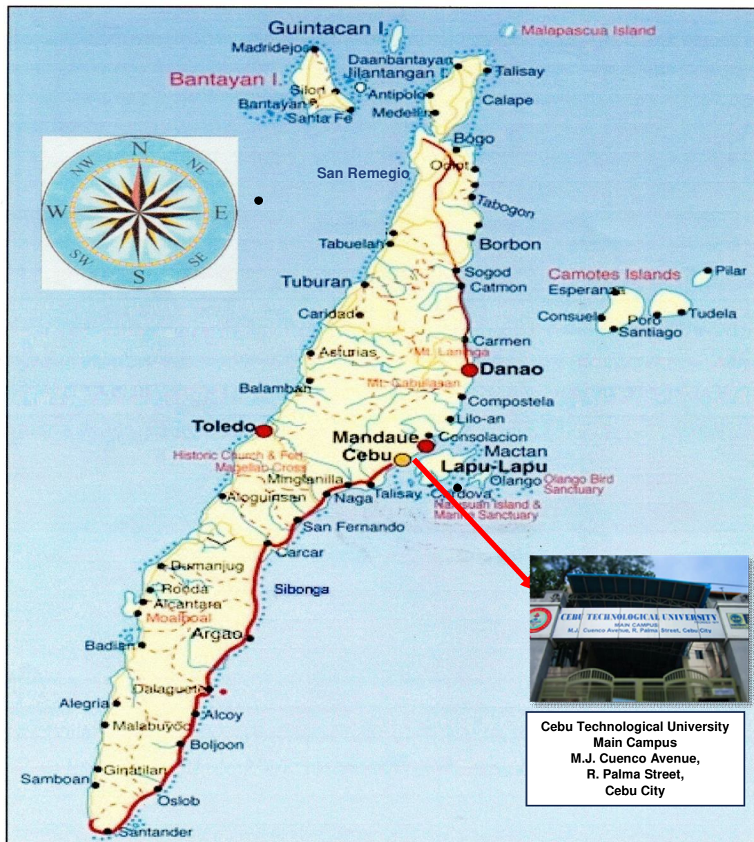
Figure 3. Location Map of the Study

The researchers aim to gather quantitative data from 45 Special Education Teachers using a complete enumeration. On the other hand, the researchers aim to collect qualitative data from these participants until data saturation is reached. The study conducted from April 2022 to May 2022 to Special Education Teachers currently taking their master's degree at Cebu Technological University from Cebu City Division, Cebu Province Division, and from other Divisions for School Year 2021-2022.