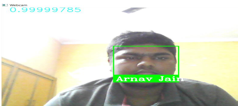
Fig 2 : Marking the Attendance