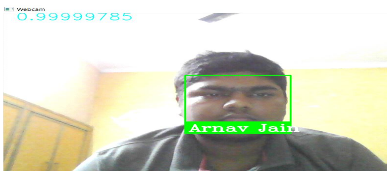
Fig 2 : Marking the Attendance