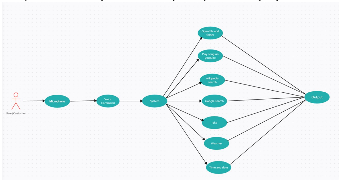
Fig 1: Use Case Diagram

It is useful for the user to perform multiple tasks only just with the voice command and it is also useful for the impaired persons who are unable to perform the tasks visually so the AURA can help them to perform the tasks just by their voice commands.