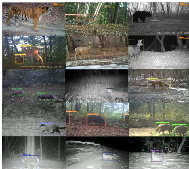
Figure 3: final output