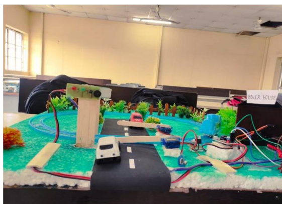
Model: Signal and Gate System