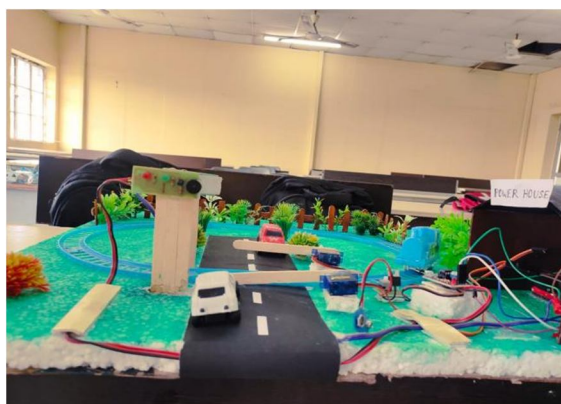
Model: Signal and Gate System