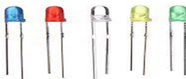
Figure 2 :LED`s

A Light Emitting Diode (LED) is a semiconductor device, which can emit light when an electric current passes through it. To do this, holes from p-type semiconductors recombine with electrons from n-type semiconductors to produce light. The wavelength of the light emitted depends on the bandgap of the semiconductor material. Harder materials with stronger molecular bonds generally have wider bandgaps. Aluminum Nitride semiconductors are known as ultra-wide bandgap semiconductors.