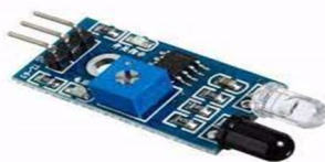
Figure 1:IR sensor

An infrared sensor is an electronic device, that emits in order to sense some aspects of the surroundings. An IR sensor can measure the heat of an object as well as detects the motion. These types of sensors measure only infrared radiation, rather than emitting it that is called a passive IR sensor. Usually, in the infrared spectrum, all the objects radiate some form of thermal radiation.