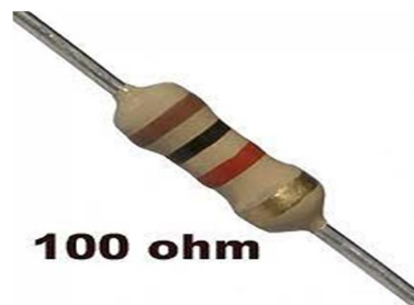
Figure 5: Resistor

A resistor is an electrical component that limits or regulates the flow of electrical current in an electronic circuit. Resistors can also be used to provide a specific voltage for an active device such as a transistor.