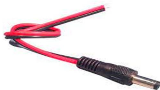
Figure 3: DC jack

A standard DC power jack or plug has two conductors with the center pin typically for power and the outer sleeve typically for ground. However, reversing this conductor configuration is acceptable.