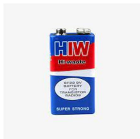
Figure 4 : Battery

A battery is a source of electric power consisting of one or more electrochemical cells with external connections for powering electrical devices. When a battery is supplying power, its positive terminal is the cathode and its negative terminal is the anode. The terminal marked negative is the source of electrons that will flow through an external electric circuit to the positive terminal. When a battery is connected to an external electric load, a redox reaction converts high-energy reactants to lower-energy products, and the free-energy difference is delivered to the external circuit as electrical energy.