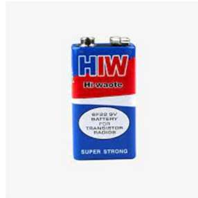
Figure 4 : Battery

A battery is a source of electric power consisting of one or more electrochemical cells with external connections for powering electrical devices. When a battery is supplying power, its positive terminal is the cathode and its negative terminal is the anode. The terminal marked negative is the source of electrons that will flow through an external electric circuit to the positive terminal. When a battery is connected to an external electric load, a redox reaction converts high-energy reactants to lower-energy products, and the free-energy difference is delivered to the external circuit as electrical energy.