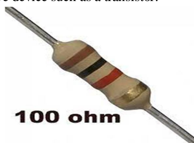
Figure 5: Resistor

A resistor is an electrical component that limits or regulates the flow of electrical current in an electronic circuit. Resistors can also be used to provide a specific voltage for an active device such as a transistor.