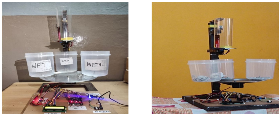
Fig 3 : Output Module

When waste is thrown in pipe, IR sensor will sense the waste. Waste is divided into three categories namely Wet, Dry and Metallic. Another sensor will sense the garbage category. As per the algorithm used, if the waste is metallic then the mechanism will bring the metal collecting bin below the pipe and with the help of servo motor the waste will fall into the metal bin. Similarly, the process will repeat if wet waste is sensed. If the sensor doesn't activated both the sensor category then waste will be considered to be a dry waste.